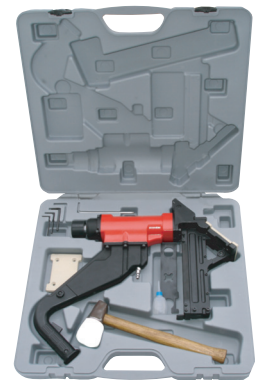
Floor Dog™ CARRYING CASE